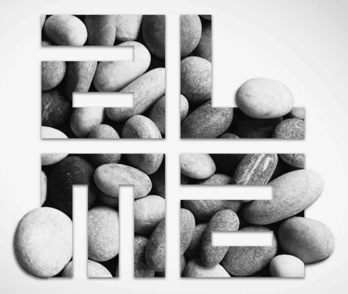
Corporate Governance Statement 2017 ALMA MEDIA CORPORATION